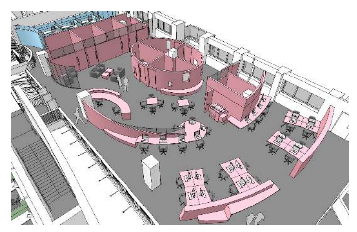
Due to the digitization of resources and the availability of these resources remotely, the role of the library has been redefined. In addition to traditional library resources, the Augsburg Gage Center offers students integrated technology and collaboration areas.

Well-designed areas that are connected or adjacent to formal learning spaces is an effective strategy to provide informal options. Lounges, courtyards, and study rooms can be located in close proximity to classrooms, labs, and other formal environments to