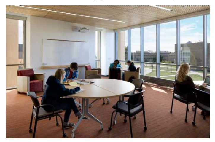
Informal spaces, as shown here at Gustavus Adolphus College's Beck Academic Hall, provide opportunity for students to be social and connected with their peers while accommodating individual preferences (e.g., comfortable seating, access to daylight, and writing surfaces).

Student demographics and characteristics (e.g., learning styles, backgrounds) offer personal influences on the learning process. Additionally, preferences for technology influence how students seek communication and engage in their education experience.