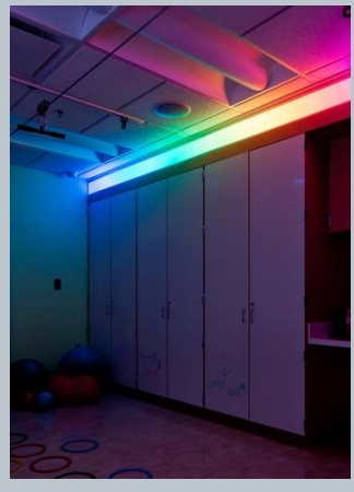
Patients felt most calm as a result of spending time in the Rainbow Room (group room), his/her room, pool, and playground. Other calming features were those that could be controlled by the patient such as the colored lights and the music