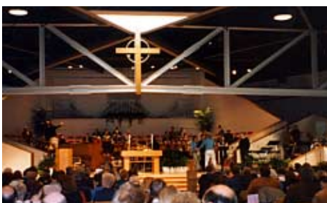
Remodeling goals at Prince of Peace focused on increasing the feeling of "permanence" in the worship space, establishing a fixed location for the chancel and music areas, enhancing members' feelings of inclusion, and supporting their active, varied and dynamic music program.