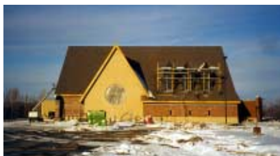
Phase I of Lord of Life Lutheran Church's new facility in Maple Grove is nearing completion.