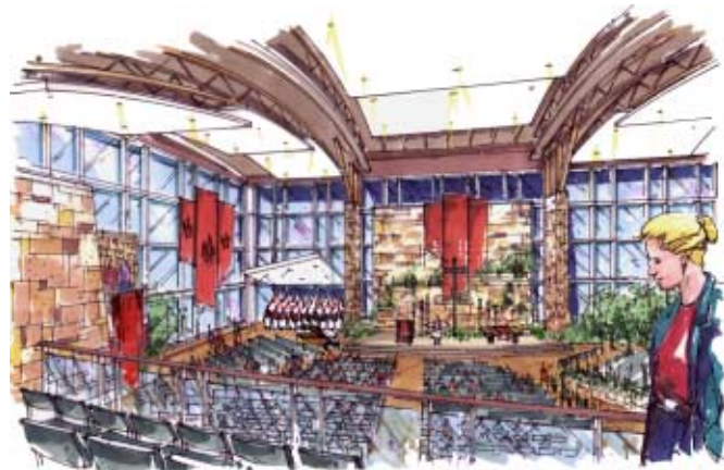
The 20,000 s.f. Celebration Center is the signature component for Shepherd's Path. It is the center of all activity, the place where "all paths meet." Seating 1,000, the facility provides space for all types of worship, concerts, and lectures.

The design of the park-like “celebration center” uses trees, rocks, water, and expansive views to evoke a sense of the holiness in all creation. Subtle images of the cross will appear through cracks and fissures in a large rock wall.