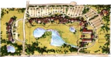
Site plan for Shepherd's Path

Plans for this faith community, which begins construction next spring, include a