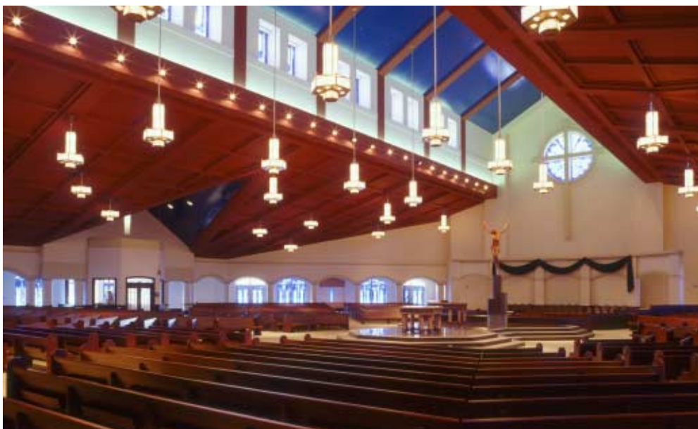
Designed as an octagon, the sanctuary at Saint Ambrose of Woodbury Catholic Church seats 1,500 people, with individuals no more than 57 feet from the altar, promoting a feeling of participation.

theater and dance — requires considerable flexibility in design. And the growing use of technology means adapting worship spaces for sophisticated sound and lighting systems.