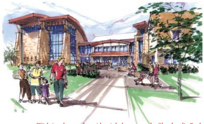
With its clustered, residential character, the Shepherd's Path facility fosters a sense of community.

Modeled after the Christian communities of the first century, where worship took place wherever people happened to gather, Shepherd of the Lake Lutheran Church in Prior Lake is building a faith community called Shepherd's Path.