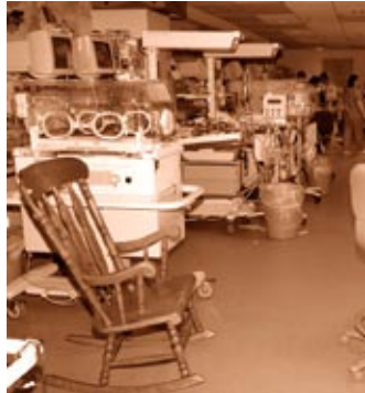
Children's Hospitals and Clinics of Mpls/St. Paul

THEN ... NICU designs of the past put most of the infants in one large open room.